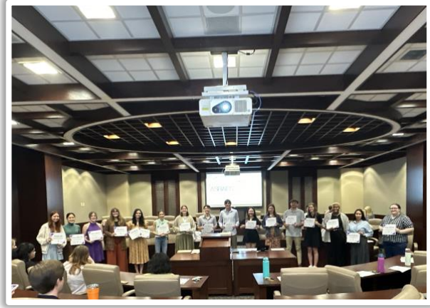
Celebration of Student Research.