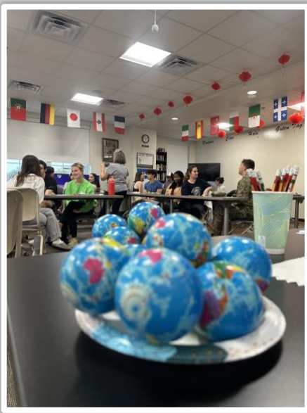
Educating global citizens.

Students who are on the waitlist will not automatically slip over into the course when a seat becomes available if (a) they are registered for another class at the same time (which they often are as a backup); (b) the addition of the class would push them over 18 hours; (c) they do not have the prerequisite for the class. If (a), ask students to drop the conflicting class. If (b), students will need to contact the Dean's Office to request an academic overload (see "Academic Overloads" on this document). If (c) and you still want to admit the student, the student will require a permission number. Here are instructions for students using permission numbers. Please do follow departmental policies in issuing the same.