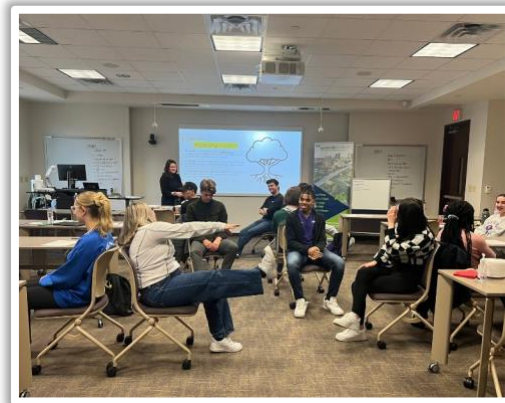
AddRan ambassadors participating in a leadership workshop.

Welcome to Fall 2024! Helping our students be successful by ensuring they are in the right courses at the right time, are tracking their own degree progress in PeopleSoft, and are completing enrollment procedures in a timely manner is important to all of us. For this reason, we've put together what we hope is a handy reference sheet for faculty and staff as we all work together with students in the first couple of weeks of the semester to get them situated. Thank you for all you do!